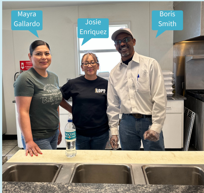
Hobbs office volunteers worked at a food bank and at Habitat for Humanity's Re-Store