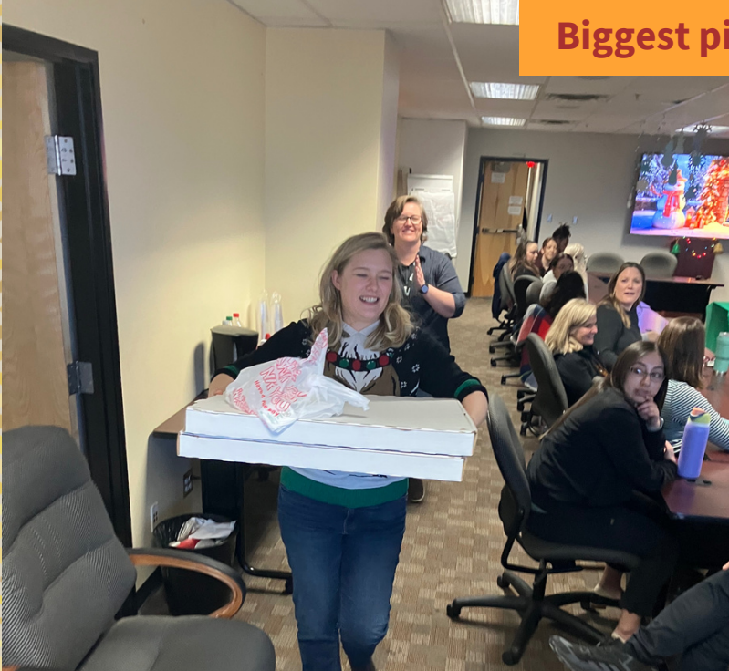
Biggest pizza ever